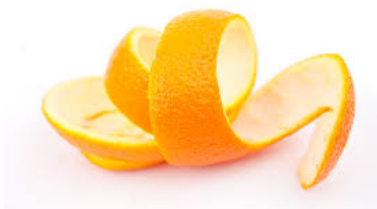
Fig 1 orange peel

Orange is used mainly in orange-juice and soft drinks industries all over the world. They discard a huge amount of orange peels. At first, the peels were cleaned with distilled water to remove dust particles and water-soluble impurities; dried in sunlight for 2 days. And kept in oven for 8 hours then grind it to a fine powder and Finally packed in air tight container and labelled (1)