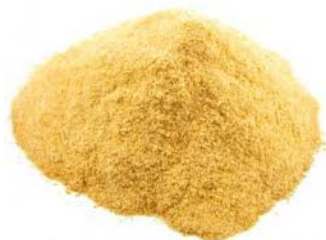
Fig 2. Orange peel powder